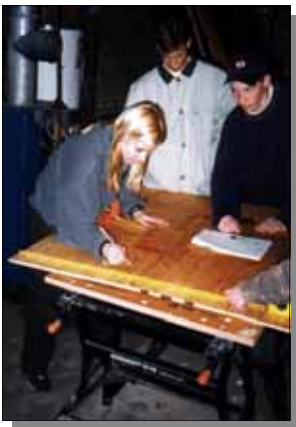
Preparing plywood for bat house construction.

This dynamic network is an effective means of fostering environmental educational experiences and stewardship, while directly benefiting the community and the environment.