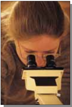
Identifying macroinvertebrates, an indicator of water quality.